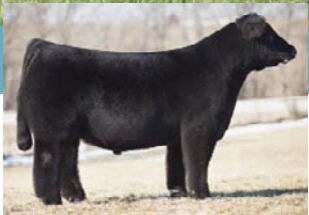
FU MAN CHU SIRE