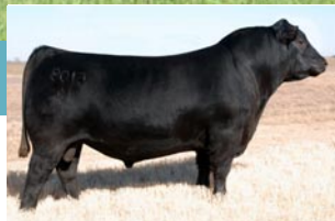
DUFF NEW EDITION 6108 MATERNAL GRANDSIRE

Big time cow potential in this Pedigree daughter. Watch this heifer come and go on a flawless set of wheels and you are sure to fall in love with her. Plenty of power and dimension, yet a presence that you can't miss when she hits you on the profile. She is elegant through her front third, robust through her middle, has plenty of shape and ties it all in beautifully on the move. A female that checks all the boxes.