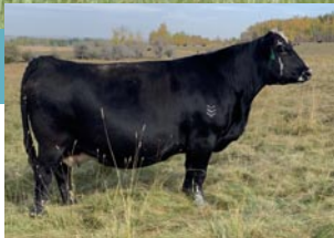
BOSS LAKE MS 41023 DAM

Normally the clubby heifers are successfully sold by private treaty, but when they are this good, they easily earn a spot in the online sale. 027H is as complete as you can make one. She can get out and move, is perfect jointed, stands on a solid foot and when you analyze her on the profile she has a really cool look about her. Fu is soft made and truly reads as being very maternal. The breeding options are endless which makes her even more unique. TH pending.