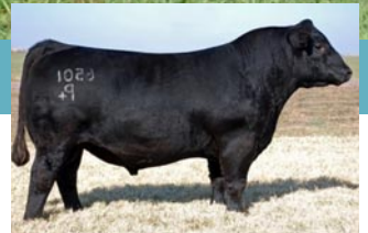
DUFF BASIC INSTINCT 6501 MATERNAL GRANDSIRE

For an operation that loves to competitively show, this female is very hard to let go of. She has a look that is hard to forget and when you analyze her lines there is not much you would change. She's big middled, jet fronted and when you set this heifer in motion she fills her track on a solid foot. This Style heifer is quite possibly one of the best Angus heifers to ever be raised at Boss Lake. If you are serious about hanging banners, this heifer is a must.