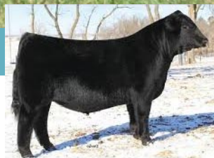
RUBYS CURRENCY 7134E SIRE