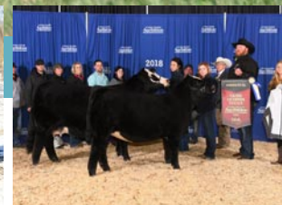
BOSS LAKE MS ELLE 638D MATERNAL SIB

The last original Elle daughter to be offered from Boss Lake and what we feel is the best one to date. Being a March, this heifer is a little greener in her condition, but don't look past her for that. She is built as good as you can make one from the ground up and ultra sound. Long necked, elegant and stylish, yet carries herself with plenty of rib shape and dimension. This female has a bright future whether its collecting banners herself, or making ones that do.