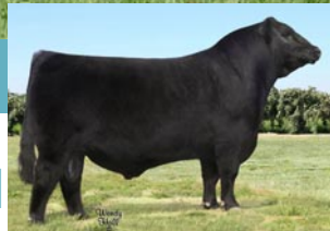
SILVEIRAS STYLE 9303 SIRE

SILVEIRAS STYLE 9303 GAMBLES HOT ROD SILVEIRAS ELBA 2520 X BOSS MISS INSTINCT 053 DUFF BASIC INSTINCT 6501 BOSS MISS ANCHOR 156-4