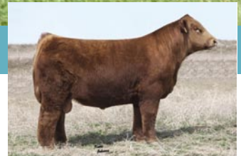
SL BULLET PROOF MATERNAL GRAND SIRE

Here is a girl that has brood cow written all over her. 008H has been a crowd favourite from day one. She impressively combines soundness, balance and power in a gorgeous dark cherry red package. You will travel a lot of miles to find a PB Limousin female that is this complete and genetically backed by proven families on both sides. Added bonus is she's super hairy and extremely gentle.