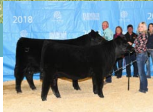
MADER OPAL 217C DAM

Who doesn't love a baldie! This Loaded Up female was a result of some embryo's purchased from Mader Ranches. 035 exemplifies all the presence and look you would expect from Loaded Up and the width, power and dimension you would get from a Mader female. She has the best attitude, is good haired, gives you a killer look and loves to show. Truly a sale highlight.