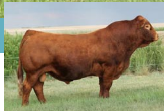
RPY PAYNES CRACKER 17E SIRE

CL YOLANDA BE COOL SL BULLET PROOF GREENWOOD PLD ULTRA FANCY