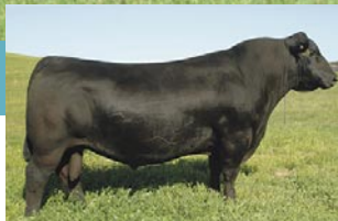
S A V PEDIGREE 4834 SIRE