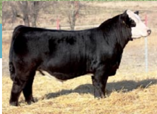
W/C LOADED UP 1119Y SIRE